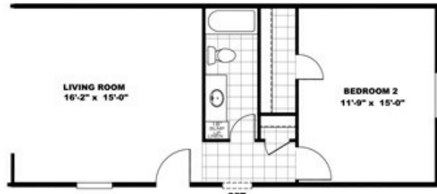
OPT. 2 BEDROOM