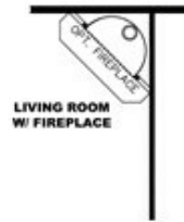
LIVING ROOM W/ FIREPLACE